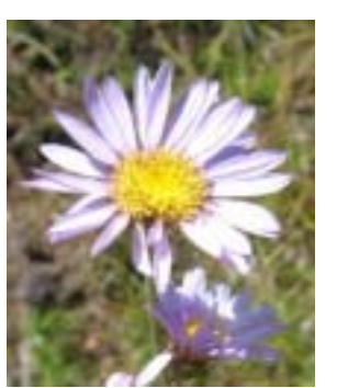
Wandering Daisy Erigeron peregrinus