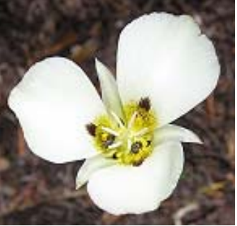
Leichtlin's Mariposa Lily Calochortus leichtlinii