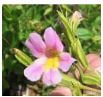
Lewis's Monkey Flower Mimulus lewisii