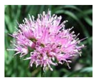
Swamp Onion Allium validum