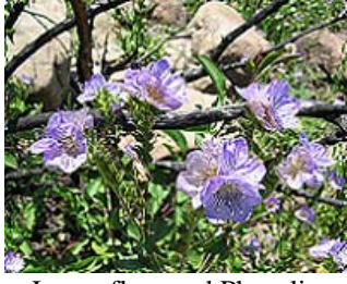
Large-flowered Phacelia ( Phacelia grandiflora )