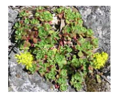
Pacific Stonecrop (Sedum spathulifolium)