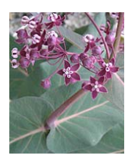
Purple Milkweed (Asclepias cordifolia)