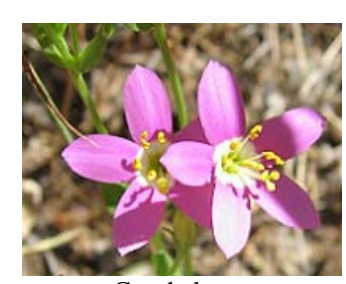
Canchalagua (Centaurium venustum)