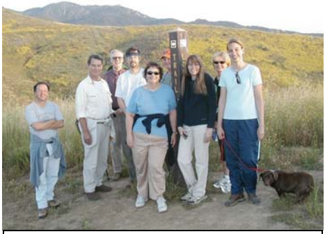
Tuesday evening Long Canyon Hiking group

Meet in Corriganville parking lot at 8 AM. We will be working until noon. Tools will be provided. Bring 2 - 3 quarts of water, hat, sunscreen, and gloves to work on the trail.