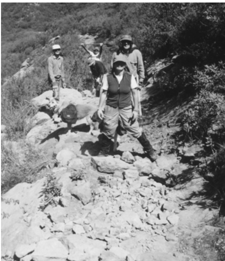
Chumash Trail - Before