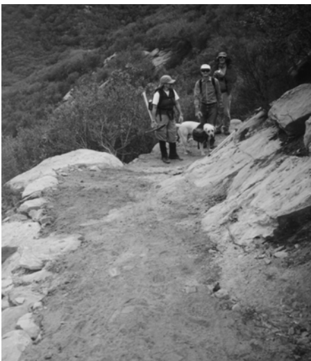
Chumash Trail - After