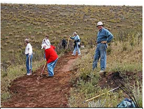
Simi Valley Presbyterian Church volunteers, working on the Lower Stagecoach Trail.