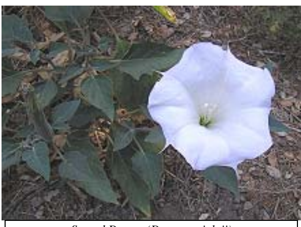
Sacred Datura (Datura wrightii)