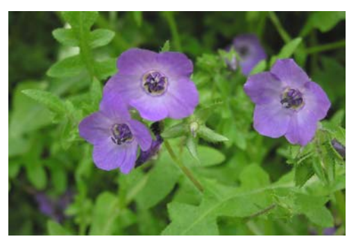
Fiesta Flower (Pholistoma aurium)