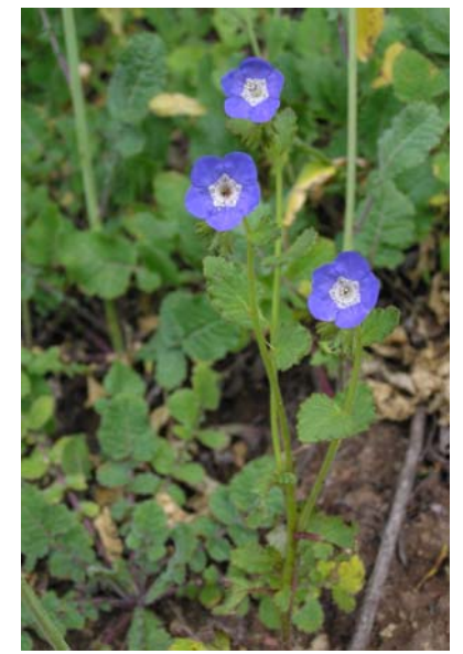
Sticky Phacelia (Phacelia viscida)