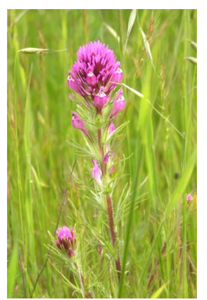
Purple Owl's Clover (Castilleja densiflora)

Here are some pictures of what's blooming this time of year: