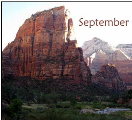
Angel's Landing – Zion

Please call Marty if you'd like to place an order: 805-526-4414